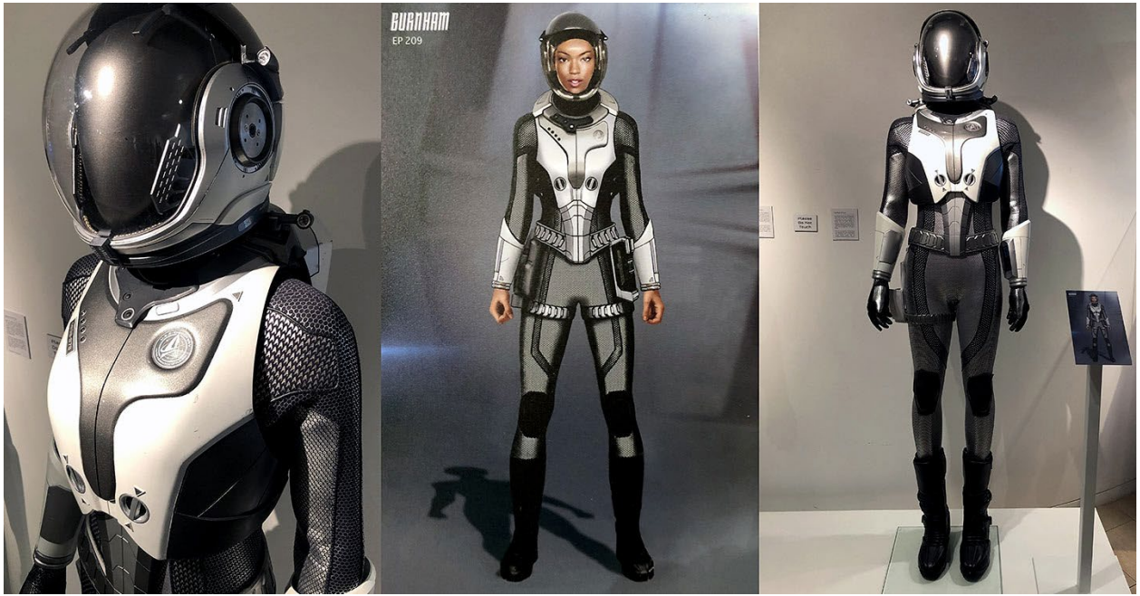
Figure 3 Discovery era EVA suits

Notes : First picture (will not be shown in art; merely hear for shape of structure) is exterior shot and pictures 2-4 are interior stage area as scene in the episode "Lethe".