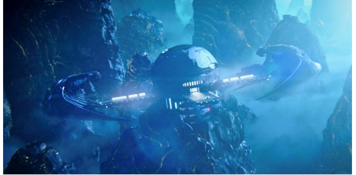
Cancri IV — Neutral meeting location where General Kol assassinated the Cancri elders.

Notes : First picture (will not be shown in art; merely hear for shape of structure) is exterior shot and pictures 2-4 are interior stage area as scene in the episode "Lethe".