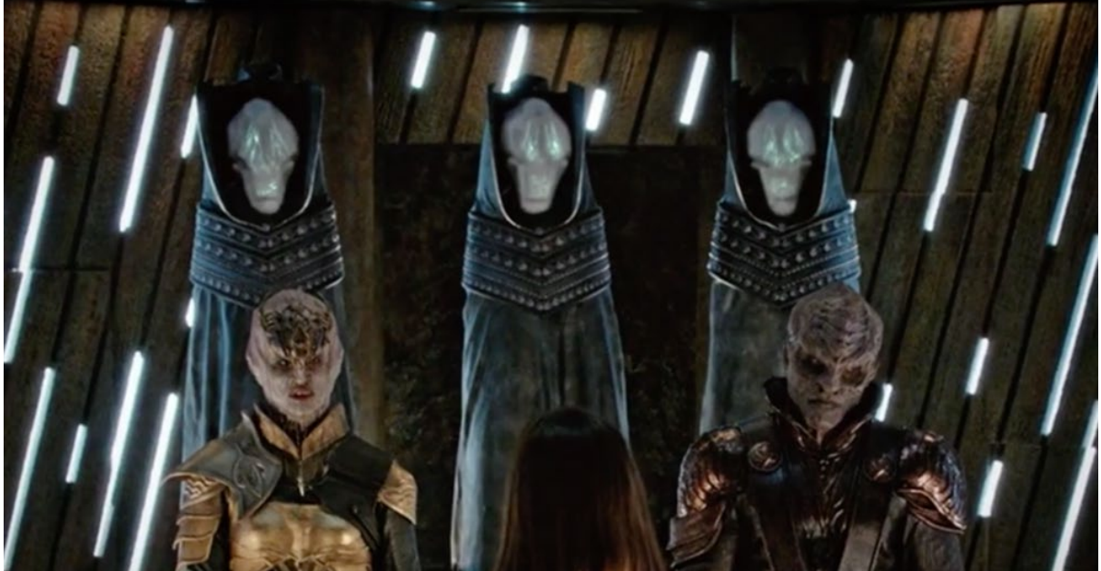
BACKGROUND: Cancri elders standing on a platform behind Klingons (DIS: "Lethe") In 2256, the Cancri were politically neutral between the United Federation of Planets and the Klingon Empire. Thus, they agreed to host a secret meeting between Vulcan and two independent Klingon Great Houses to discuss the possibility of an alliance. However, the meeting was a trap set by General Kol, and the Klingon party slaughtered the Cancri elders present.