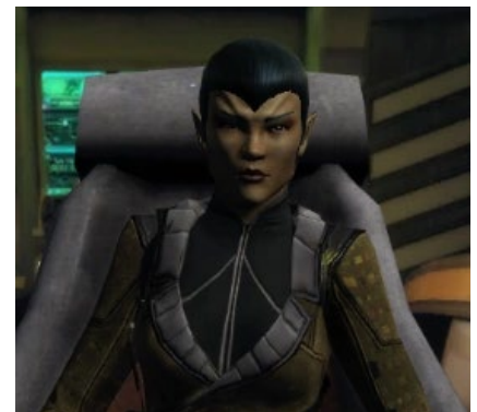
Source: Star Trek Online

MHEVEN, COMMANDER OF IRW T'VAREN : It matters not, Captain. Once my vessel is repaired, we will take the spy ship in tow regardless of who is aboard. Your crews will be prisoners of war, and—